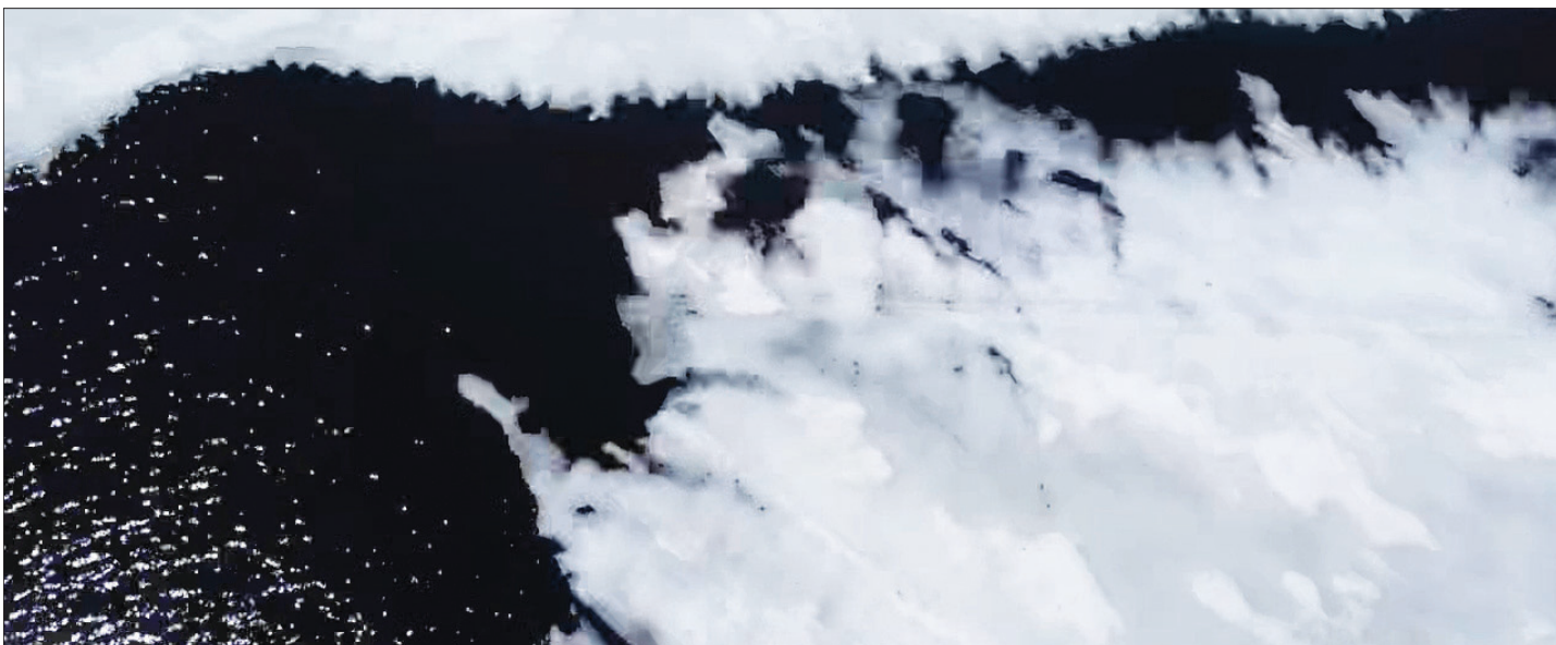
An aerial view from a drone, about 90 feet above the water, shows lingering ice on Van Patten Lake on June 26.

Nancy Dauble prepares morels for later consumption and storage by slicing them lengthwise, cleaning the hollow stem, and letting them air dry.