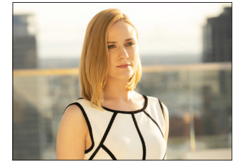
Evan Rachel Wood