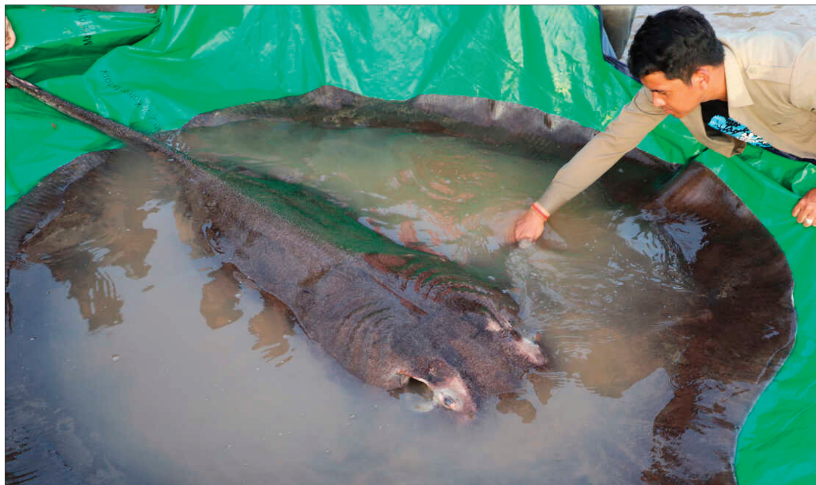
taken on June 14, 2022, a man touches a giant freshwater stingray before being released back into the Mekong River in the northeastern province of Stung Treng, Cambodia. A local fisherman caught the 661-pound stingray, which set the record for the world's largest known freshwater fish and earned him a $600 reward.

The stingray's catch was not just about setting a new record, he said.