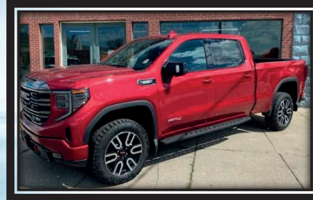
2022 GMC Sierra 1500 AT4 DIESEL $68,995.00