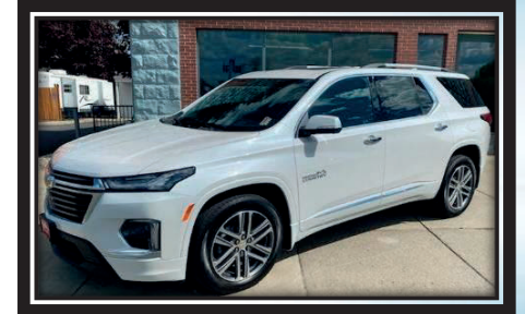
2022 Chevrolet Traverse High Country $56,265.00