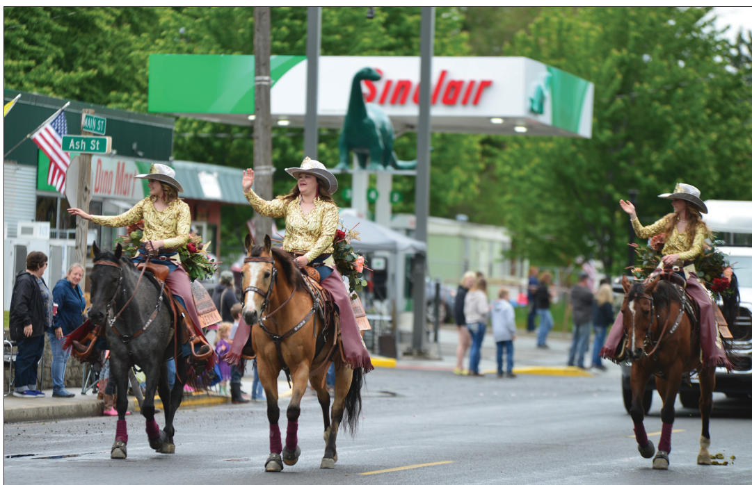
Isabella Crowley/The Observer