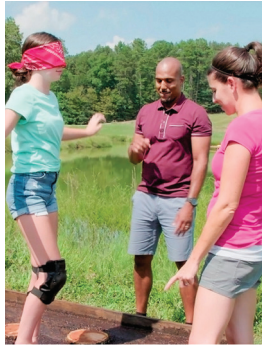
Disney+ FAMILY REBOOT

Spouses Kelly Ripa and Mark Consuelos are among the executive producers of this six-part unscripted series that follows families whose busy schedules and interests have drawn them apart as they undertake a journey to reconnect, spend uninterrupted time together and establish new relationships and bonds. (ORIGINAL)