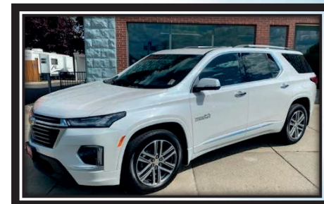
2022 Chevrolet Traverse High Country $56,265.00