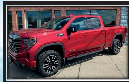
2022 GMC Sierra 1500 AT4 DIESEL $68,995.00