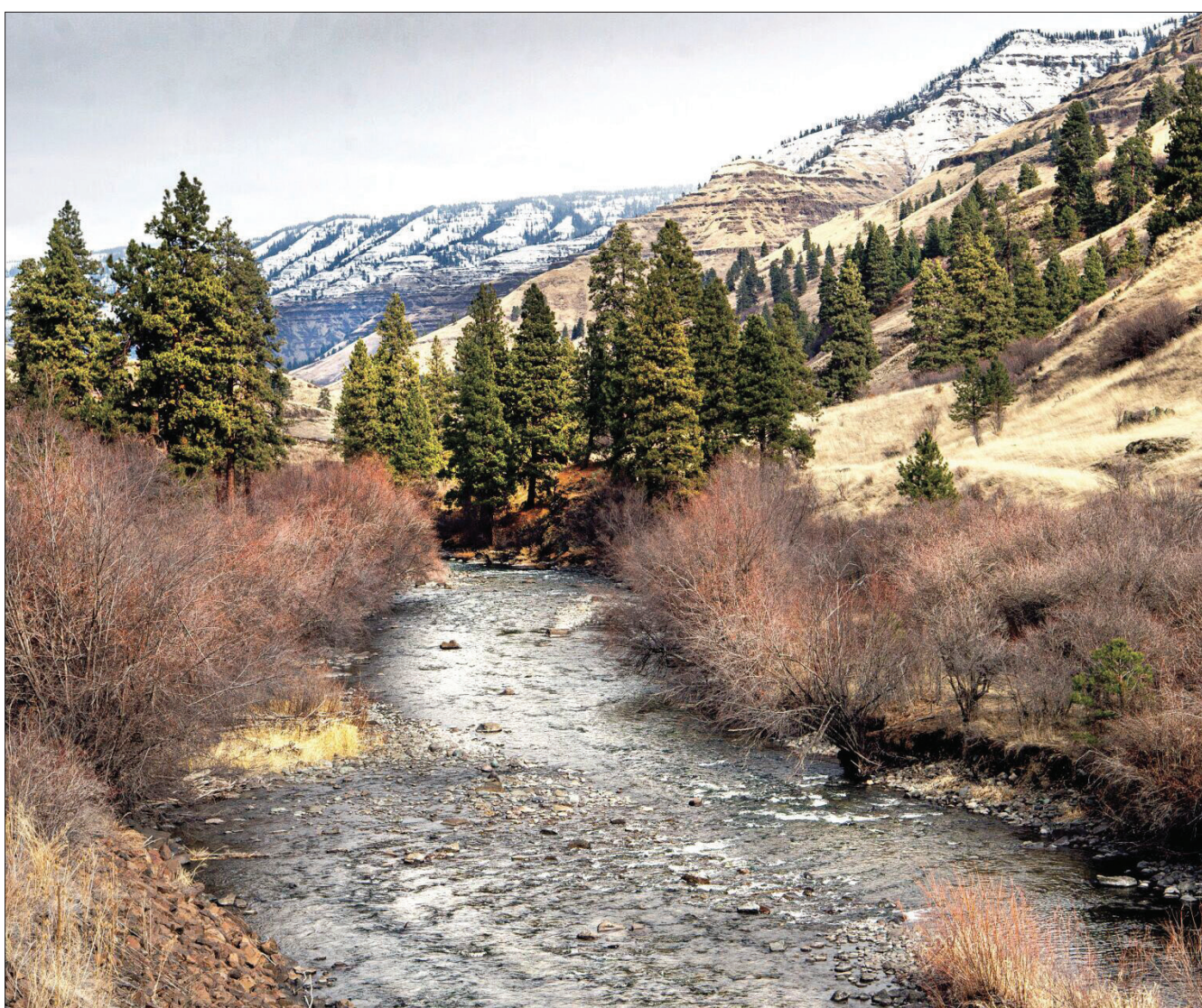
The Imnaha River winds through Wallowa County.

Anglers have been successful catching bass, and bass fishing will likely improve throughout the year as the water temperature increases. Trout fishing will probably be good in the coming months especially when water temperatures are in the low 50s.