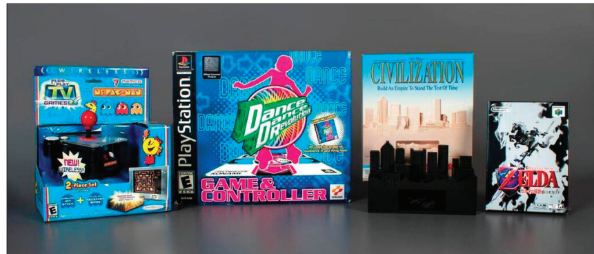
shows Ms. Pac-Man, Dance Dance Revolution, Sid Meier's Civilization and The Legend of Zelda: Ocarina of Time. More than 40 years after blazing a trail for female video game characters, Ms. Pac-Man was inducted Thursday, May 5, 2022, into the World Video Game Hall of Fame, alongside Dance Dance Revolution, The Legend of Zelda: Ocarina of Time and Sid Meier's Civilization.

Konami's Dance Dance Revolution, first seen in arcades in Japan in 1998, was recognized for helping to pave the way for other music-cen-