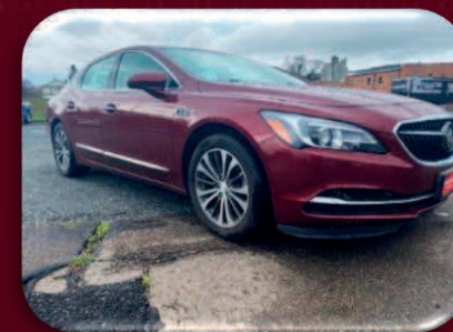
2017 Buck LaCrosse $28,995