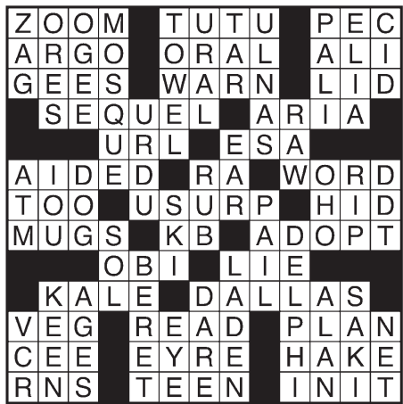
4-20-22