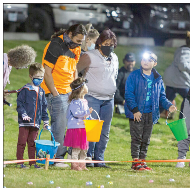
Egg hunters prepare for the 2021 Flashlight Easter Egg Hunt at Butte Park in Hermiston. This year's version is at 8 p.m. Friday, April 15.

Kids are to bring their own basket and flashlight. Parents may accompany their children but kids should gather their own eggs.