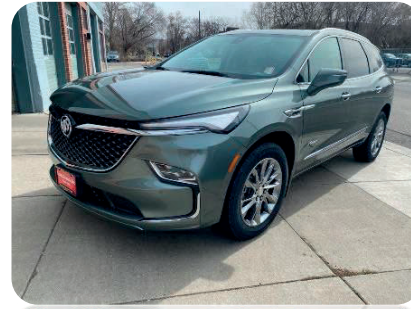
Buick Enclave Avenir $61,215