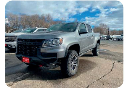
Colorado ZR2 DIESEL $49,995