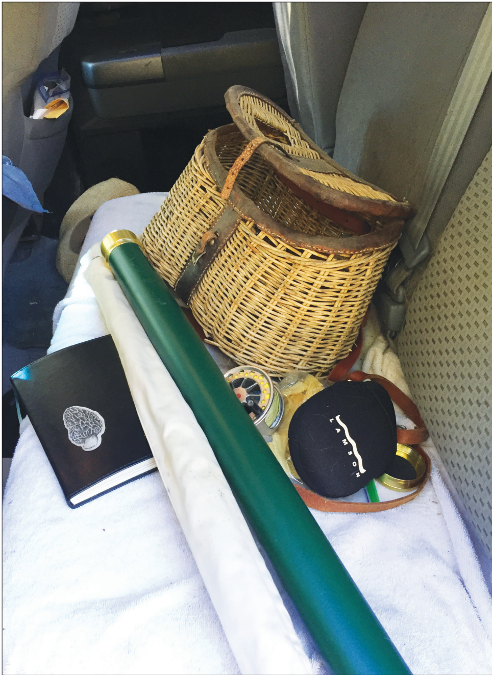
Grandpa Harry's fish box rides in the backseat along with my fly rod, reel, and journal.

The first order of business is to rub a liberal amount of Neatsfoot oil into badly cracked leather trim. I order a replacement shoulder strap with correct dimensions ($35 plus $10 shipping) from a fly shop in Wyoming. The brass buckle and tongue piece are salvaged from the original shoulder strap and a rear handle is fashioned from a short piece of rolled cowhide. The circa 1940 metal studs still function as if new. While not muse-