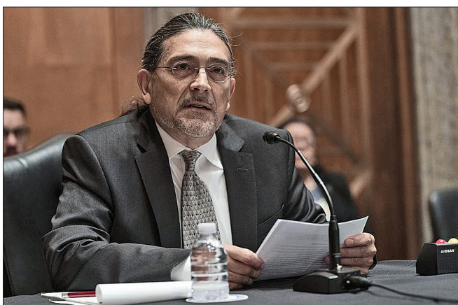
Census Bureau Director nominee Robert Santos testifies before the Senate Homeland Security and Governmental Affairs committee, Thursday, July 15, 2021, on Capitol Hill in Washington. Santos said Monday, Feb. 21, 2022, that he has gone on a listening tour with stakeholders and the agency is making permanent community outreach efforts in an effort to restore any trust that was lost following attempts by the Trump administration to politicize the nation’s head count.

WASHINGTON — Is it time to rethink the census and other surveys that measure changes in the U.S. population? Policymakers and demographers have been asking that question since results released by the U.S. Census Bureau this month showed Black, Hispanic, American Indian and other minority residents were undercounted at greater rates in 2020 than in the previous decade. On the top of that, results from a version of its most comprehensive survey that compares year-to-year changes in U.S. life had to be mostly scrapped because disruptions caused by the pandemic produced fewer responses in 2020. “The current model of coming up with a master address list, mailing everybody an invitation — like you’re inviting people to a party and hoping they respond, and if not, you’re going to track them down