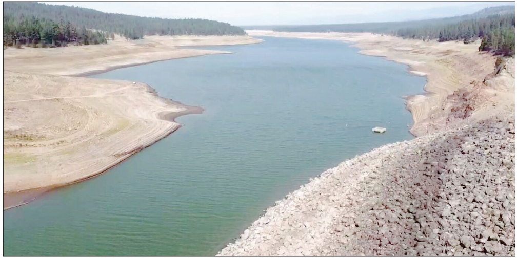
This image taken from a drone on Tuesday, Aug. 17, 2021, shows Mason Dam at lower right, and the water intake structure, center right near the shore, at Phillips Reservoir.

Major flooding and significant damage might affect about 500,000 people, which is far fewer than in most years. Above average precipitation and other factors increased flood risk near the Red River that divides North Dakota and Minnesota, NOAA said.