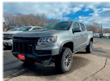
Colorado ZR2 DIESEL