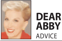
DEAR ABBY ADVICE

DEAR ABBY: My husband and I have had some crazy life swings since the beginning of the pandemic, mostly positive. I found a wonderful, well-paying job that I enjoy. In our 16th year of marriage, we have also brought a healthy, happy daughter into our lives. We recently bought a lovely home, and have added another, nicer, used car to our assets. In addition, my job allows my husband to live his dream of being a stay-at-home dad with our daughter.