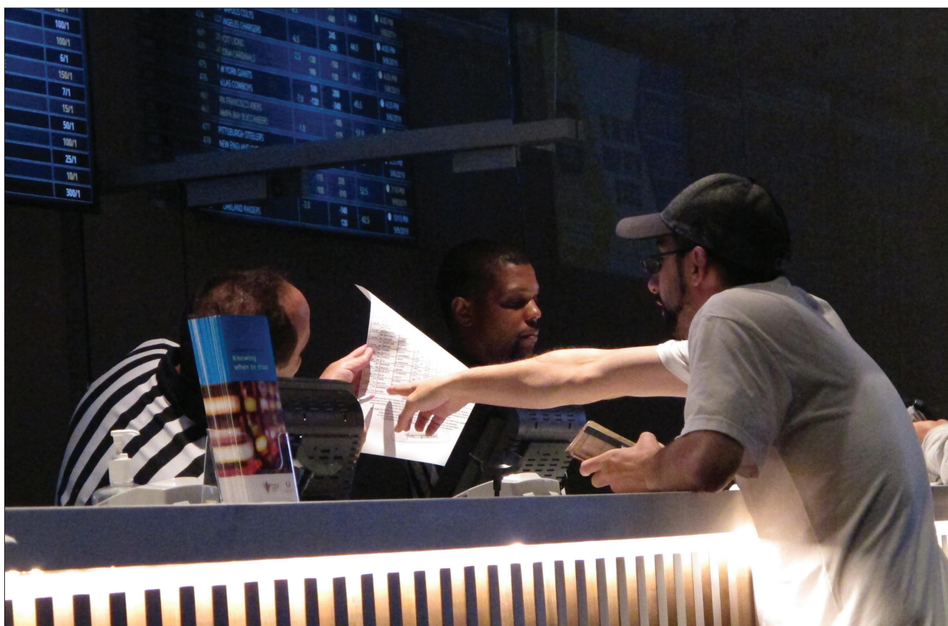
A gambler makes a sports bet at Bally's casino in Atlantic City N.J., Sept. 5, 2019. A record 31.5 million Americans plan to bet on this year's Super Bowl, according to the gambling industry's national trade group. The American Gaming Association on Tuesday, Feb. 8, 2022, released its annual predictions for wagering on pro football's championship game, forecasting that over $7.6 billion will be bet legally and otherwise.

Since last year's game, 45 million additional people will be able to bet on the Super Bowl because their states have legalized sports betting over the past year: Arizona, Connecticut, Lou-