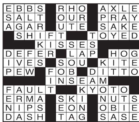
2-10-22 © 2022 UFS, Dist. by Andrews McMeel for UFS