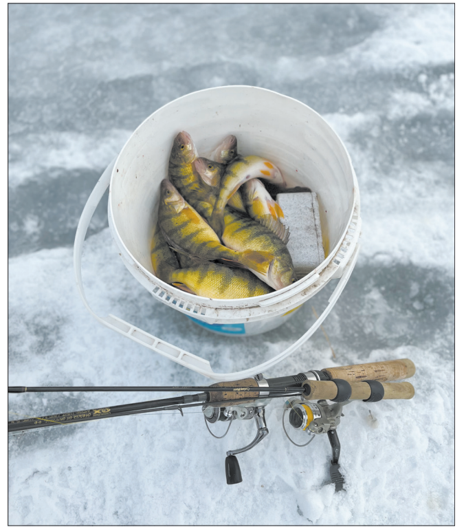
A bucketful of perch makes for a fine January day on an ice-covered lake.