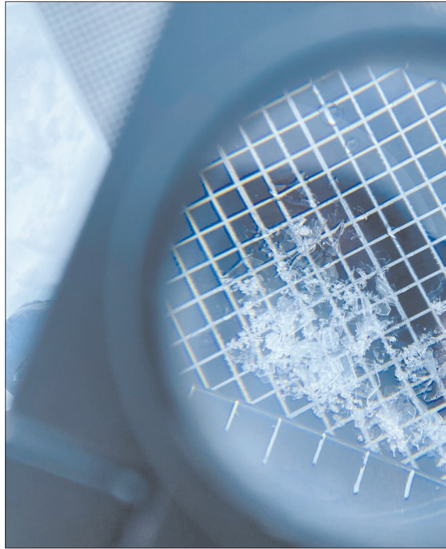
Avalanche experts use a magnifying glass to study snow crystals. Over time, crystals can change shape, leading to unstable layers in the snowpack.