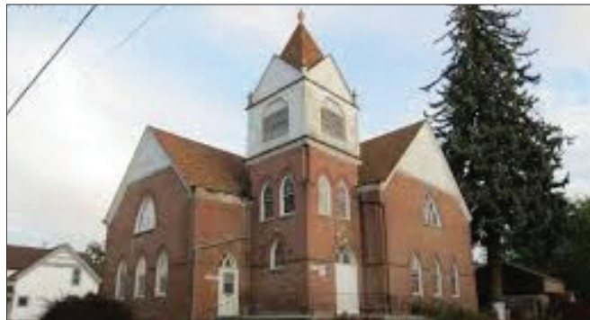
The Catherine Creek Community Center will host a paint night at 6 p.m. Thursday, Jan. 27. Cost is $40 and all supplies are provided.