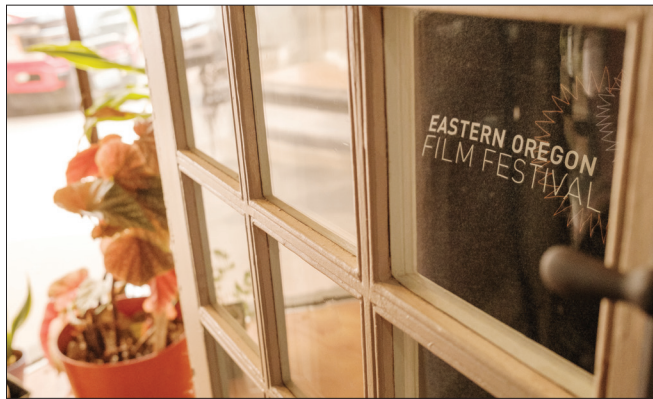
A T-shirt with the Eastern Oregon Film Festival logo hangs in the window of HQ in La Grande on Wednesday, Sept. 8, 2021. The 2022 film festival is slated to show at venues from Thursday, Oct. 20, to Saturday, Oct. 22, in La Grande.

The annual festival, held in La Grande, is working toward holding screenings in the Liberty Theatre, which is under renovation, according to a press release. The Filmmakers Residency Program has been postponed to 2023 while the organization focuses on operations at the theater. The organization also is