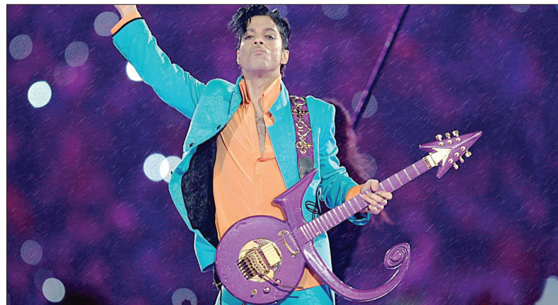
Prince performs in Miami on Feb. 4, 2007. The six-year legal battle over pop superstar Prince's estate has ended, meaning the process of distributing the artist's wealth could begin in February 2022.

a well-funded New York music company — Primary Wave — and the three oldest of the music icon's six heirs or their families. The IRS and Comerica settled last spring on the real-estate portion of Prince's estate. But the trickier task of valuing intangible assets such as rights to Prince's music was not completed until October. As part of the agreement, the IRS dropped a $6.4 million "accuracy-related penalty" it had levied on Prince's estate. The Minnesota Department of Revenue, which agreed on the estate's valuation, also has dropped an accuracy penalty, the filing said.