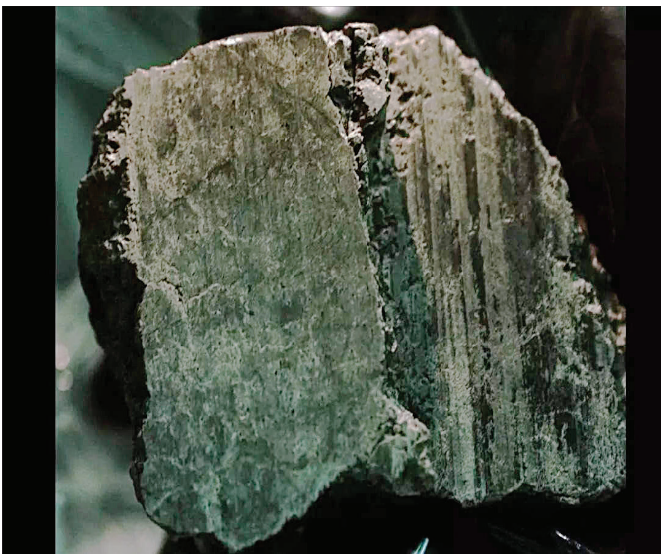
The meteorite labeled ALH84001 is held in the hand of a scientist at a Johnson Space Center lab in Houston, Aug. 7, 1996. Scientists say they've confirmed the meteorite from Mars contains no evidence of ancient Martian life.

Groundwater moving through the cracks in the rock, while it was still on Mars, formed the tiny globs of carbon that are present, according to the researchers. The same thing can happen on Earth and