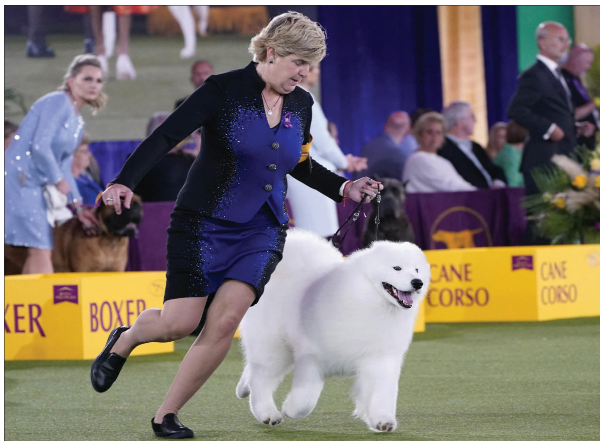
The handler of a Samoyed runs with her dog before the judges in the working group category at the Westminster Kennel Club dog show, on June 13, 2021, in Tarrytown, N.Y. The Westminster Kennel Club's annual dog show has become the latest event to be postponed or canceled in New York as the number of coronavirus cases surges.

Omicron has intensified already significant staffing issues for airlines, which winnowed workforces in 2020 as air travel