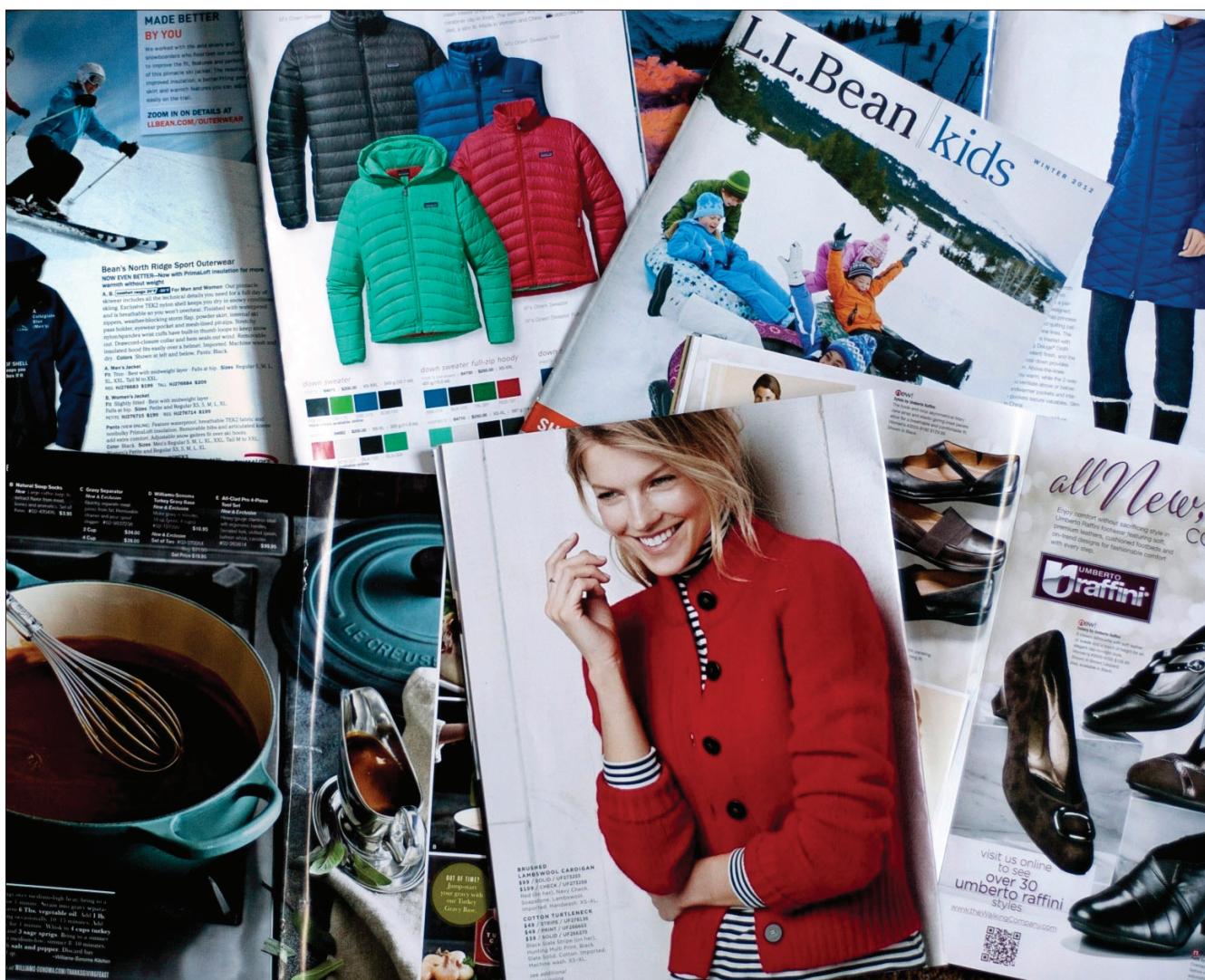
A selection of catalogs are displayed in Freeport, Maine. A big postal rate increase over the summer hasn't stopped catalog retailers from stuffing mailboxes this holiday season. The U.S. Postal Service says more than 300 million catalogs flooded into people's mailboxes last month and that overall the number of catalogs has grown 12% over last year.

For starters, digital advertising on e-commerce websites has grown as much as 20% to 40% this year even as privacy policy changes — Apple's efforts in particular — have made it more difficult to target ads and measure their