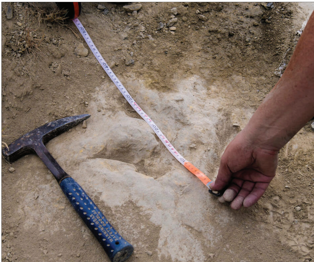
A researcher measures a 120 million year-old fossilized dinosaur footprint in the La Rioja region in northern Spain, while doing research about dinosaur running speeds, in October 2020. Scientists discovered one of the quickest sets of theropod tracks in the world through this research.

Scientists think there may be other faster dino-