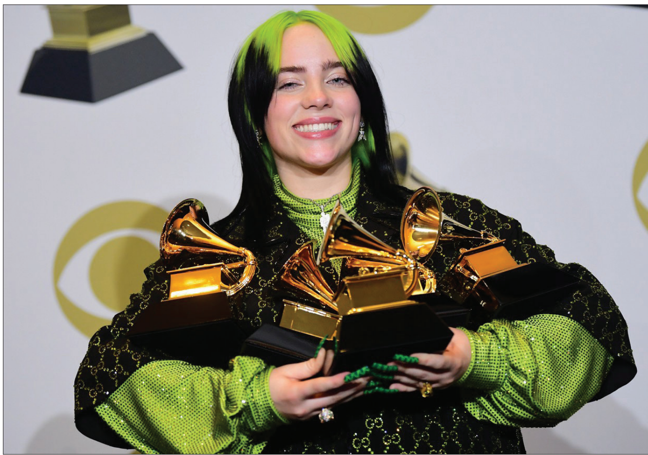
Billie Eilish, the Grammy Award-winning singer-songwriter, made it onto this year's list of most mispronounced words as compiled by the U.S. Captioning Company, which captions and subtitles real-time events on TV and in courtrooms.

"As a language teacher, it's always interesting to see that some of these terms are