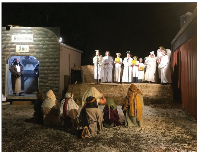
The La Grande Living Nativity, hosted by the Seventh-day Adventist Church, re-creates Bethlehem at the time of Christ's birth.

The event began around 2004 and has grown in size and popularity since