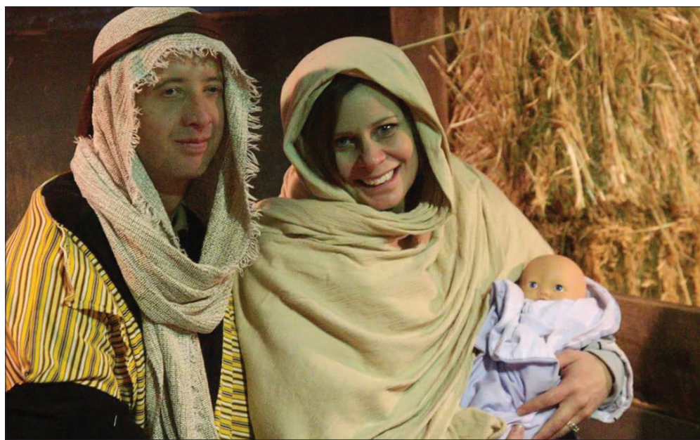
The Living Nativity, hosted by the La Grande Seventh-day Adventist Church, returns on Friday, Dec. 10, and Saturday, Dec. 11, 2021, from 5-8 p.m.