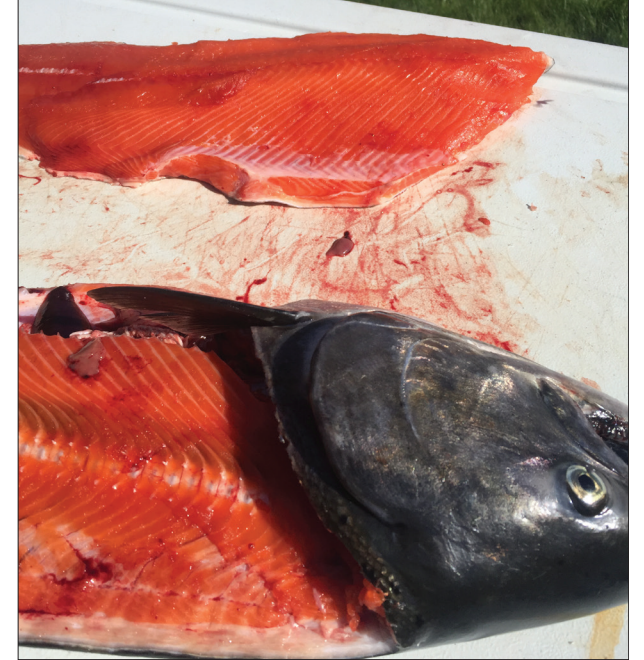
Trimmings from the backbone of a fresh salmon carcass can be cooked up to make a delicious salmon spread.

Dennis Dauble has written five books about fish and fishing, including his latest, "Chasing Ghost Trout." Learn more at Dennis DaubleBooks.com.