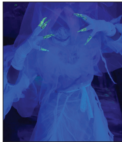
Churchill Haunted Studios is open nightly on Friday, Saturday and Sunday beginning Oct. 8. A "no scare" hour starts at 5:30 p.m. on Sundays.

Churchill Haunted Studios opens Oct. 8 and continues every weekend through Halloween in Baker City.