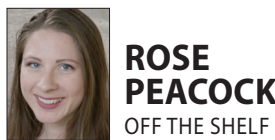
ROSE PEACOCK OFF THE SHELF

Cook Memorial Library staff is excited to announce that in-person programming has resumed. All in-person programs, except Storytime, will be held in the Community Room. Masks are required for ages 5 and older for library use and for program participation. All library programs are free.