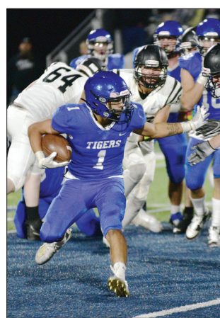
Alex Wittwer/The Observer

Even with the impressive running from the