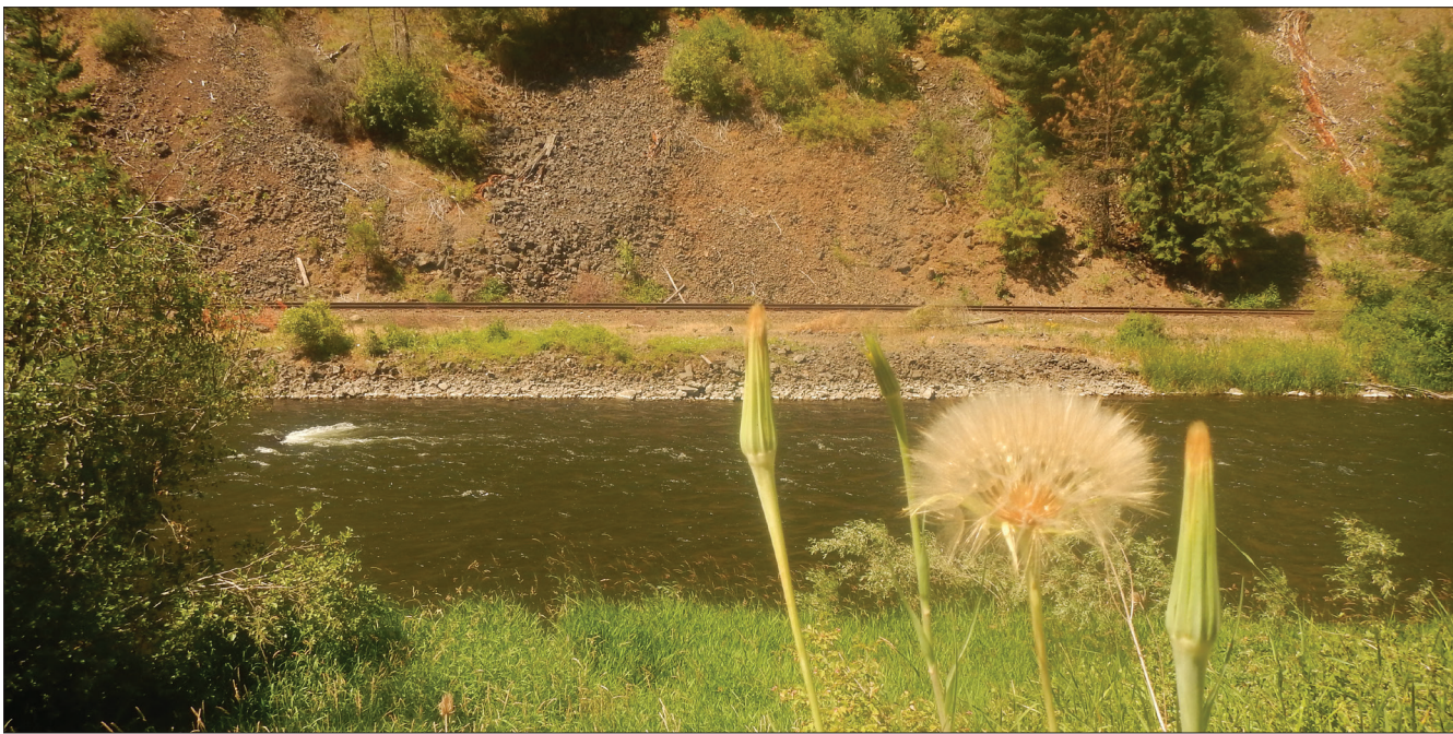
Railroad tracks parallel much of the Wallowa River. A pontoon boat provides with access to both shorelines and increases odds of success.