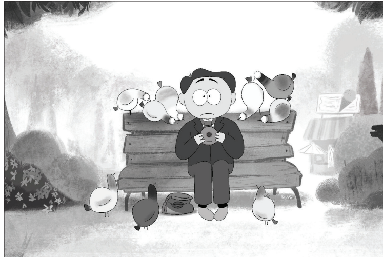
Submitted "Pigeon" is featured in the We Like 'Em Short film festival.