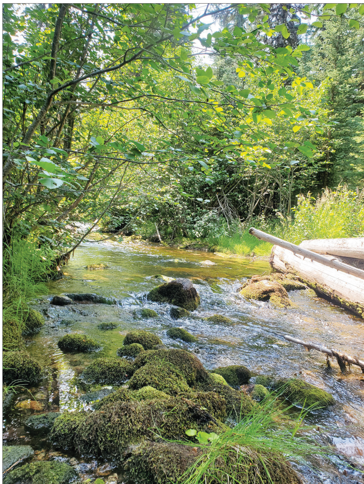
The east fork of the Grande Ronde River flows through a remote, heavily forested canyon.

(The John Day River is about 100 miles longer but I'm not