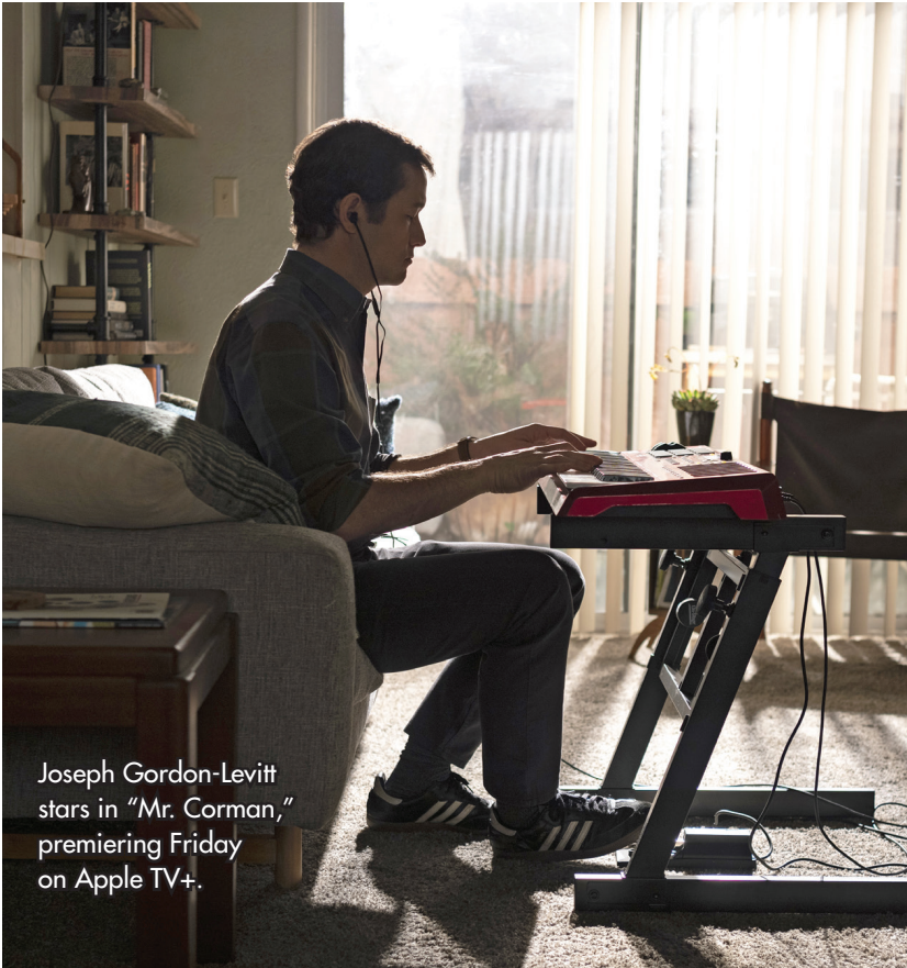
Joseph Gordon-Levitt stars in "Mr. Corman," premiering Friday on Apple TV+.

Josh Corman is a man underwhelmed by life and himself. As played by Joseph Gordon-Levitt ("Third Rock From the Sun," "Lincoln") in the Apple TV+ comedy series "Mr. Corman," which begins streaming Friday, Aug. 6, he's a 30-something born and raised in the suburbs of Los Angeles whose life hasn't turned out as he envisioned.