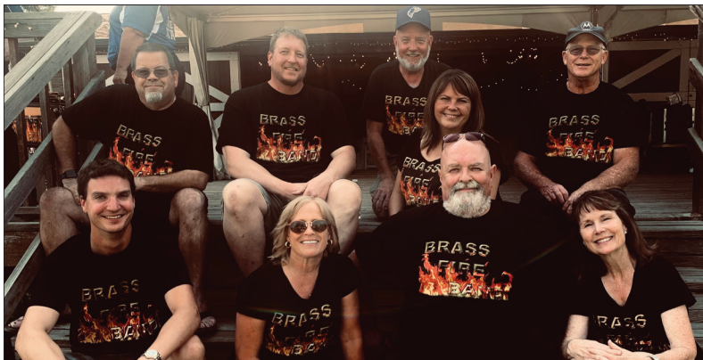
Brass Fire plays Sunday, Aug. 1, in Baker City.