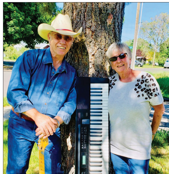
Barefoot & Bonafide plays Saturday, July 31, in Baker City.

Hermiston-based Brass Fire plays jazz, funk, blues, rock and swing in the Eastern Oregon