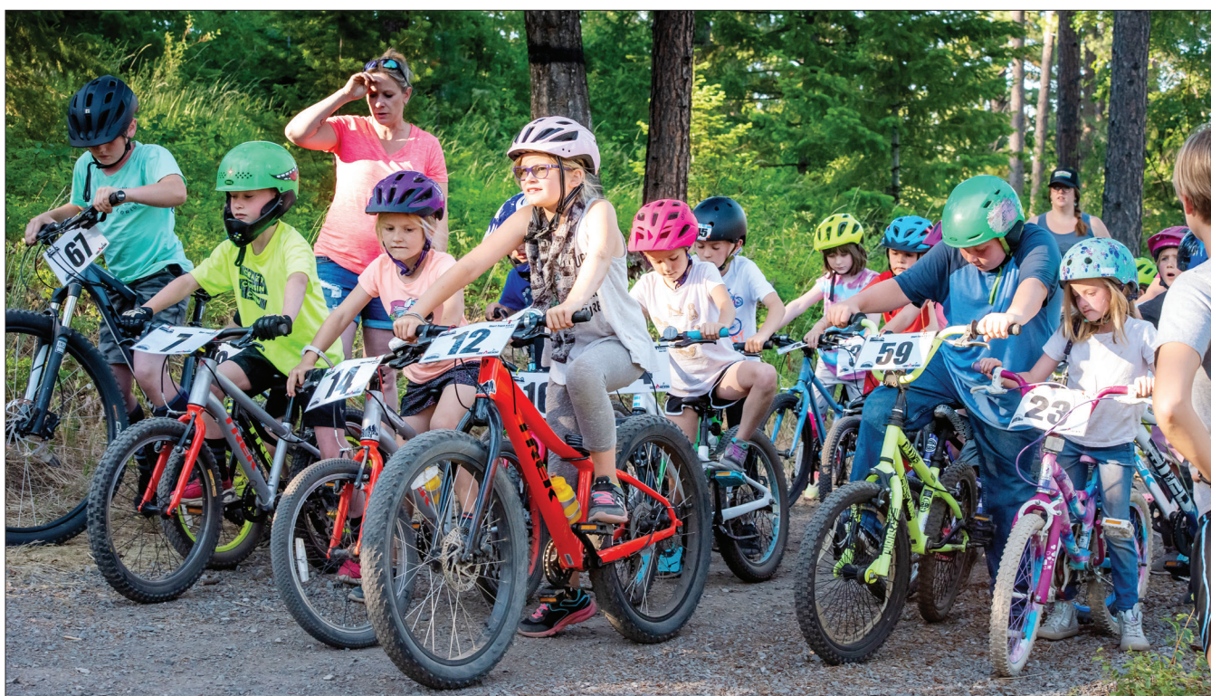
Children take part in a Short Track Race Series held at the Owsley Trailhead at the Mount Emily Recreation Area, near La Grande, on Monday, June 21, 2021. Several dozen kids took part in the event hosted by Blue Mountain Singletrack Trail Club, whose volunteers maintain the mountain bike trails at MERA. The event is held every Monday at 6 p.m., with free bikes for children who need them.