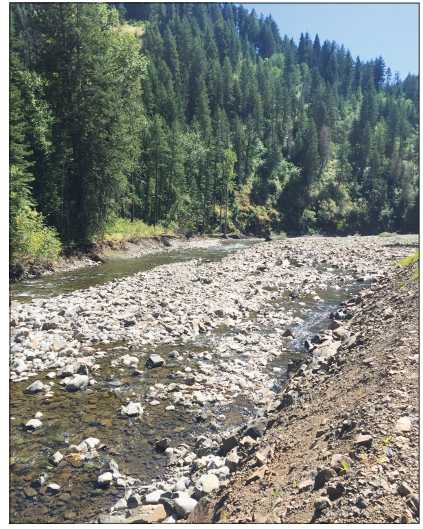
Long, wide shallows and bare cobble shorelines remain in Blue Mountain streams as evidence of the massive February 2020 flood.