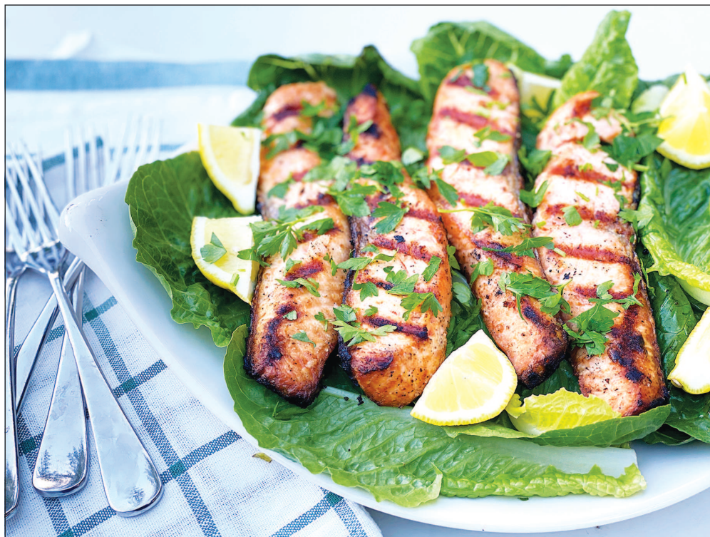
Mayo grilled salmon.