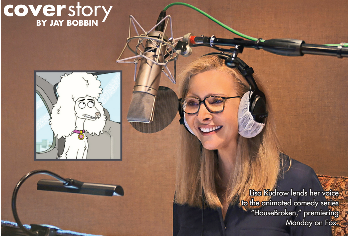
Lisa Kudrow lends her voice to the animated comedy series "HouseBroken," premiering Monday on Fox.