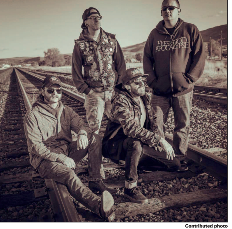
The bandTrailer Hitch opens for every concert this summer.

p.m., and gates close at 10:30 p.m. Tickets are $20 and available at