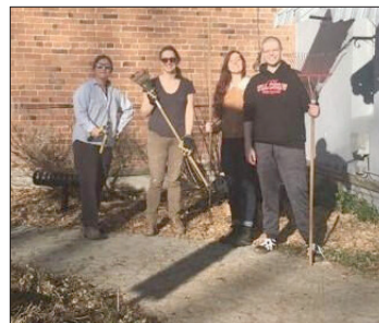
Volunteers are needed to maintain a pocket park on Washington Avenue near downtown La Grande. The pollinator-friendly garden is home to a dozen native species.

Rose Peacock oversees adult services at Cook Memorial Library, La Grande.