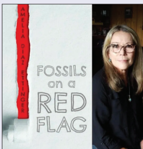
Art Center East/Contributed Image