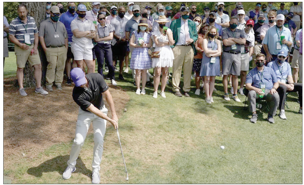
Rory McIlroy of Northern Ireland hits out of the rough on the sixth hole during the first round of the Masters golf tournament on Thursday, April 8, 2021, in Augusta, Georgia.