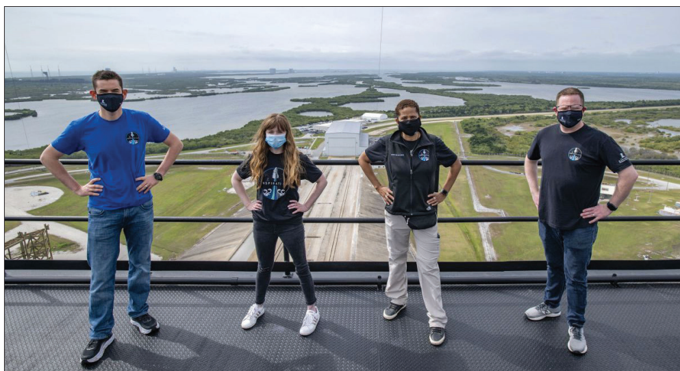
Jared Isaacman (from left), Hayley Arceneaux, Sian Proctor and Chris Sembroski pose for a photo, Monday, March 29, 2021, from the SpaceX launch tower at NASA's Kennedy Space Center at Cape Canaveral, Florida.

who will serve as spacecraft commander, still won't say how much he's paying. He's donating $100 million to St. Jude, while donors so far have contributed $13 million, primarily through the lottery that offered a chance to fly in space.