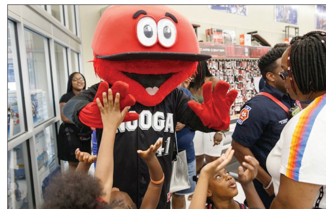
Children from the YMCA Westside and Salvation Army high-five Looie the Lookout on July 18, 2019, in Chattanooga, Tennessee. The Chattanooga Lookouts announced Wednesday, March 31, 2021, on Twitter that the costume for Looie the Lookout has been returned home safe. The team told authorities the mascot's costume was stolen from an office at AT&T Field on Tuesday, along with merchandise and equipment.

The Lookouts told authorities the mascot's costume was stolen from an office at AT&T Field on Tuesday, according to a Facebook post from Chattanooga police. Looie's head