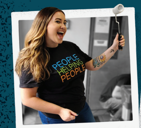
A fresh update