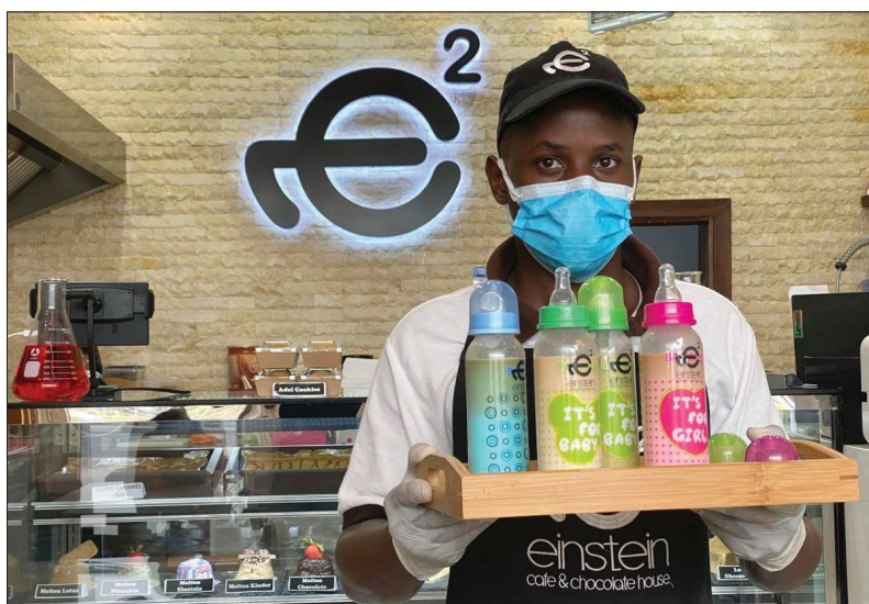
Kamran Jibreili/Associated Press

Pictures of baby bottles filled with colorful kaleidoscopes of drinks drew thousands of likes on Instagram and ricocheted across the pop-